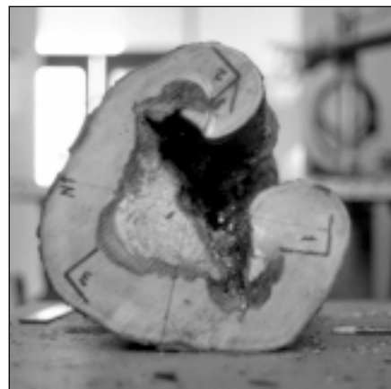
Figure 2. Typical treatment tree shown in cross section, including sample numbers and compass north. Samples 1 and 2 refer to W1 samples, and sample 3 refers to B2 samples in the text.

containing woundwood, named woundwood position one samples (W1); and one from opposite the wound, presumably containing barrier zone cells, but not woundwood, named barrier zone position two samples (B2) (Figure 2 and Figure 3). We did not perform an anatomical analysis of the samples. The samples were located by compass direction and were taken from the outermost growth rings. We also took three samples from the normal bolt of wood matched