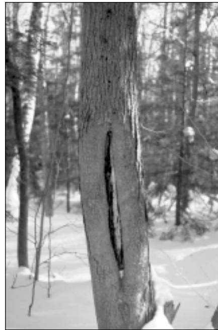
Figure 1. Typical treatment tree harvested to test toughness of woundwood and normal wood samples.

Since we were not interested in site effects on toughness measures, we grouped all 22 treatment trees together to increase statistical power. From each treatment tree, we cut two bolts of wood, one with woundwood, and one without any woundwood. From each bolt of wood, we took three samples, one from each side of the wound, presumably