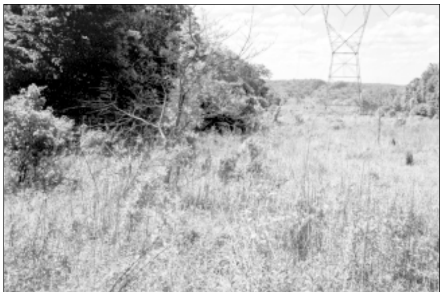
Figure 2. A stem–foliage spray unit on the Green Lane Research and Demonstration Area. The border zone is on the left, and the wire zone is on the right (photo by R. Yahner, May 2002).