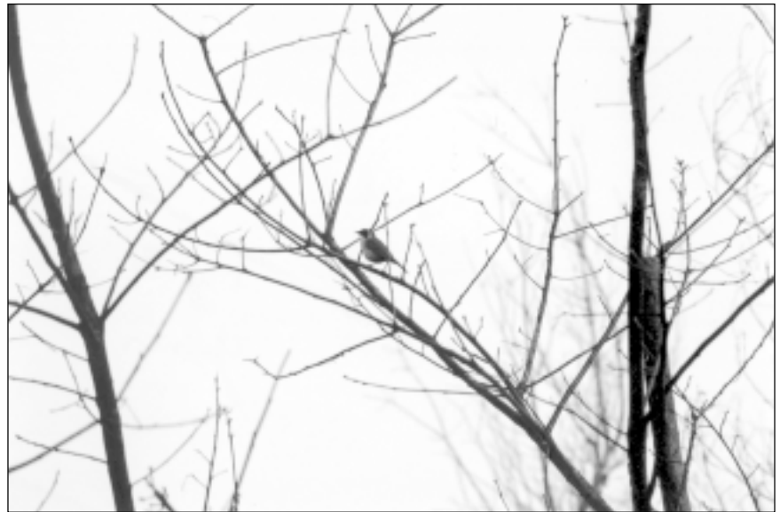
Figure 3. A common yellowthroat using a perch site on the Green Lane Research and Demonstration Area.

Breeding-bird population changes following right-of-way maintenance treatments. J. Arboric. 18:23–32.