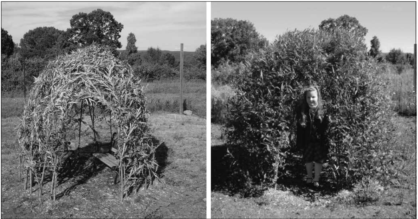
Figure 4. Weaving (left) and pruning (right) resulted in different appearances of the same module.

are available as part of the online article from www.plantscience.uconn.edu/kuzovkinacv.html .