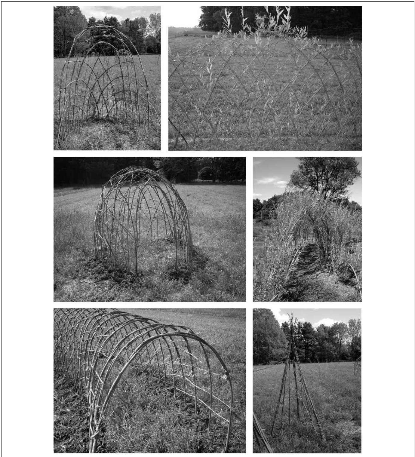
Figure 1. A portfolio of modules of living structures made of willow stems developed during the study.

18 in) of the soil profile, an important feature for the easy removal of plants.