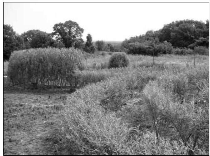
Figure 3. Planted April 2006; photo taken August 2007. Fourteen months were required for the best visual appeal.

on the upper part of the stem (1 m [3.3 ft] from the ground). Stems of thicker diameters were used in 2006. With these, lateral growth was distributed more equally along the stems. Dense lateral growth is highly desirable because it affects the foliage density, the efficiency of shielding, and overall visual appeal.