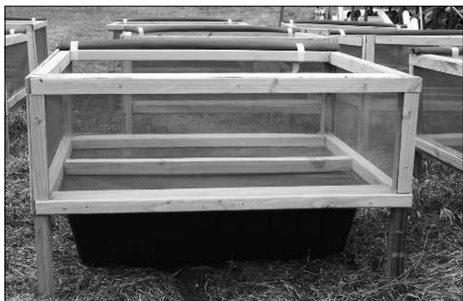
Figure 2. Mesh enclosure setup for containment and collection of Emerald Ash Borer adults in outdoor treatments.

of the logs to sustain a second generation or EAB with a 2-year life cycle or a second generation.