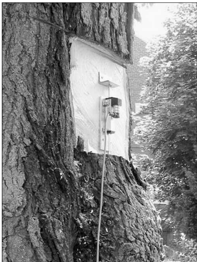
Figure 2. Linear variable displacement transducer setup used to measure fiber strain.

where P is twice the tension in the cable, \alpha is the angle between the cable and the ground, l is the distance between the block and the point of failure, and a and b are the dimensions of the stem cross-section normal and parallel to, respectively, the applied load. Stress was also calculated on the trunk at breast height (1.4 m [4.6 ft] aboveground) using Equation 1 (except that l represented the height of the block minus 1.4 m [4.6 ft] and a and b represented the corresponding cross-sectional dimensions at breast height). A substantial portion of the trunk cross-section was decayed on one red maple. For that tree, the decayed portion was omitted from the stress calculation by calculating both the area and second moment of area of the cross-section using a photograph of the cross-section and the parallel axis theorem (Lardner and Archer 1994). This procedure was described in detail by Kane and Ryan (2004).