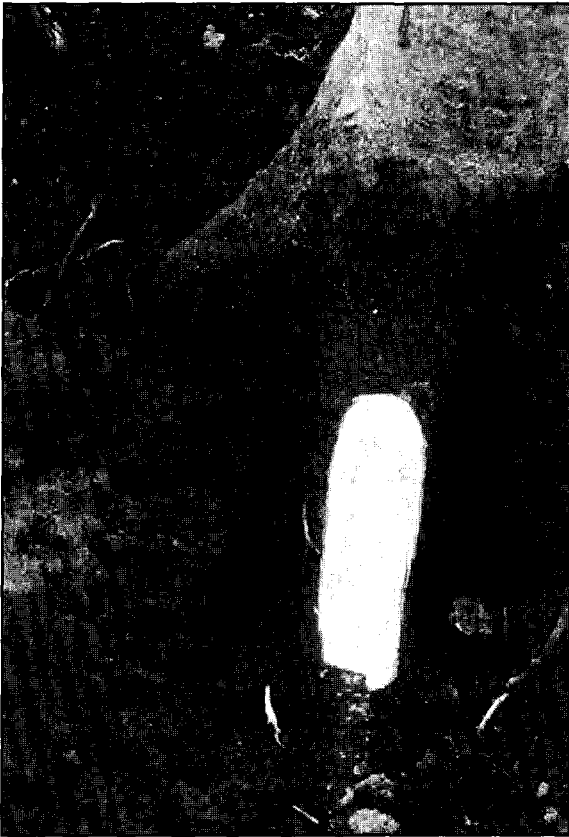
Figure 2. Excavated Norway maple root with bark removed (root injury, treatment 5).

All treatment trees, except deep-planted trees, were planted at proper depth with their root flare/collar at soil surface.