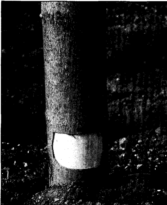
Figure 1. Norway maple with a portion of the bark removed on the south side (trunk injury, treatment 4).

Treatment 8 was a group of 15 trees that were planted along the streets of Milwaukee. These trees were originally selected as nontransplanted controls. However, because space was needed in the nursery, they were dug and transplanted at the same time as the rest of the study trees following recommended planting procedures (as prescribed in treatment 7). The only difference between treatments 7 and 8 was planting location and watering pattern. The city planting crew watered these trees at planting time, and adjacent residents were asked via a message hung on the doorknob of the residence to provide followup watering. None of the trees transplanted in the nursery were watered due to wet conditions at planting time. A survey requesting watering information was sent to the 15 adjacent addresses of the transplanted street trees. Seven of nine (78%) returned surveys stated that residents watered their trees during the first growing season.