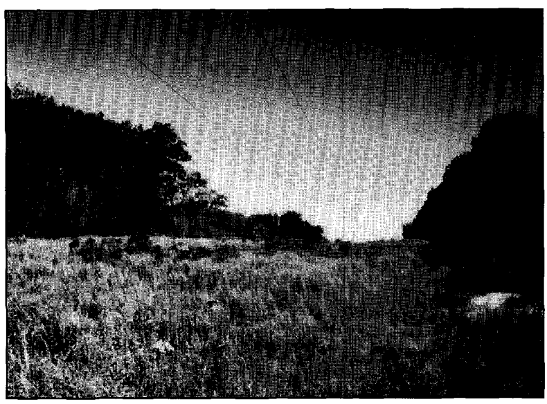
Figure 2. Mowing plus herbicide spray unit MH-3, June 2, 1998. A forb-grass cover type was being invaded by sweet fern. A shrub-forb type occupied the border zones.

Two major characteristics of ROW butterfly populations were used to measure the effects of ROW treatments, namely, species diversity (number of species