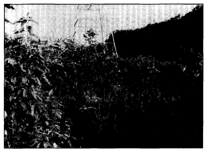
Figure 3. Handcutting unit HC-1, August 1, 1995. A tree-shrub cover type was on the wire zone. A patch of goldenrod and hay-scented fern occupied a small opening.

per unit) and species abundance (number of individuals per acre in each unit). Data were collected from 7 census counts distributed over the 1997 growing season to cover major flowering periods.