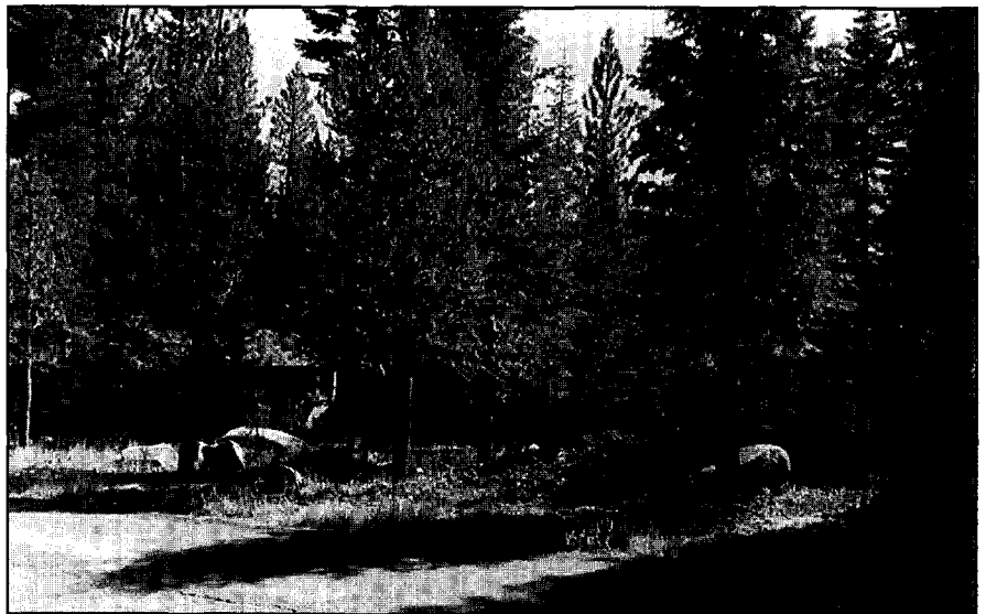
Figure 4. The same property in Figure 3 after prescribed value-enhancing thinning (similar view angle).