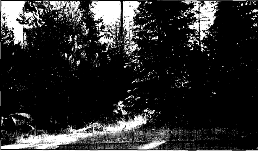
Figure 3. A typical LTB property in need of arboricultural treatment.

health do not arise solely from the aesthetic effects. Fire risk in the Lake Tahoe Basin, like many urban interface areas in the U.S. west, has become widely recognized by residents recently, and markets may reflect the benefits of reduced fire risk from managed improvements. Such benefits, however, are inherently jointly produced from proper tree and stand care.