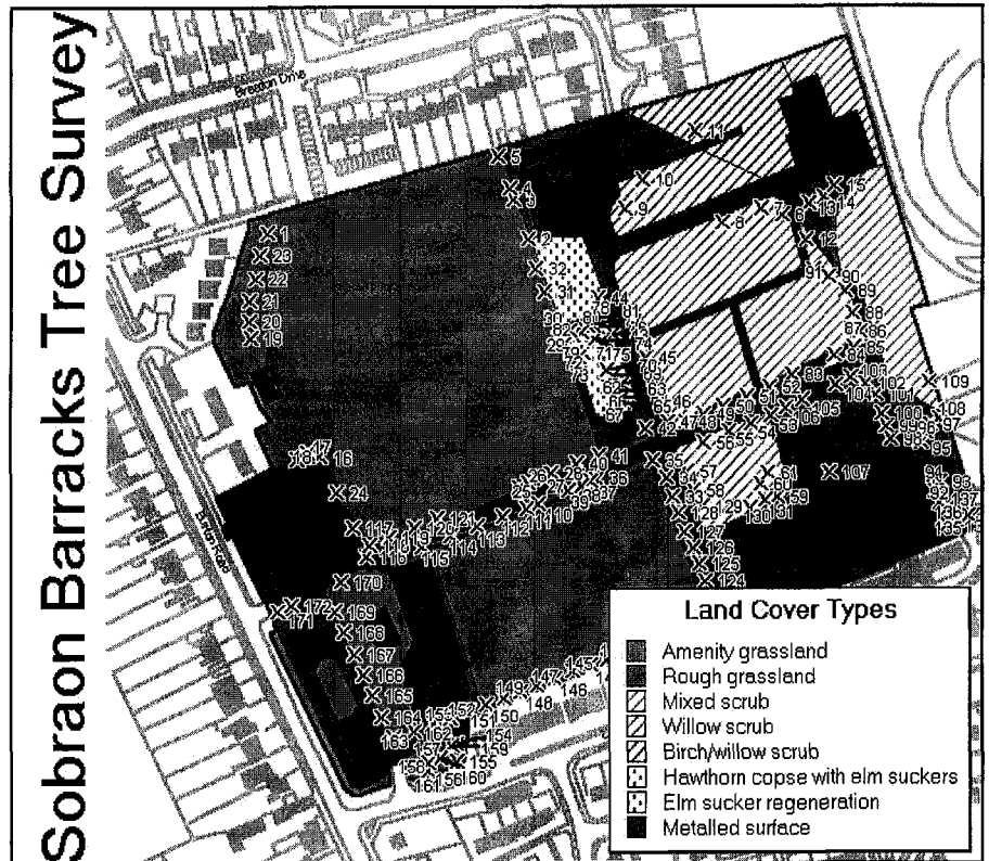
Figure 1. Tree locations and land cover types.

Global positioning systems allow rapid and accurate mapping of landscape features while the use of geographic information systems technology allows rapid access, processing, and updating of tree survey data. The use of this data in the field using a laptop computer should aid the professional tree surgeon in de-