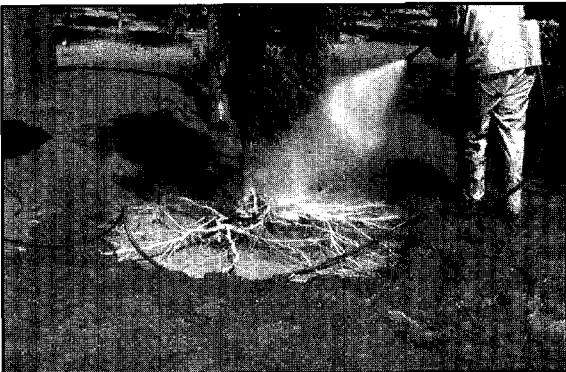
Figure 2. Full root systems were excavated in-place using a hydroexcavation technique. Soil is washed from the roots and the soil-water slurry vacuumed into a large holding tank.

Roots Inside Barriers. Although roots within barriers were not measured for size or depth,