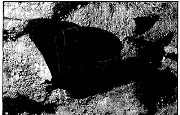
Figure 1. Circling barriers are used to protect hardscape elements from damage by deflecting tree roots vertically to the bottom of the barrier. In this study, four commercially available root barriers were used to examine root development inside and outside barriers.

Aside from not finding a consistent root response to barriers, these reports suggest that rooting depth on the outside of barriers may be related to soil conditions underneath and to the outside of the barrier. In soils favorable for root growth, roots may remain deeper in the profile; in unfavorable soils, roots may tend to develop near the surface. This study was initiated to further evaluate tree root response to circling barriers. Specifically, our objectives were four-fold: 1) to quantify root growth and root distribution of Lombardy poplar ( Populus nigra 'Italica') and Raywood ash ( Fraxinus oxycarpa 'Raywood') trees planted with and without circling barriers, 2) to assess root response to different types of barriers, 3) to evaluate the influence of a subsurface barrier on root distribution, and 4)