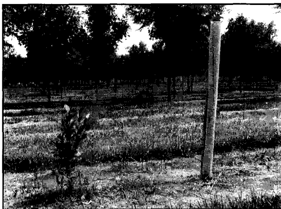
Figure 2: Magnolia stellata in the second year at Root's Nursery, control tree and emerging from tree shelter.

due to greater growth in the first year ( Cornus 'Celestial'), or in the second year ( Acer griseum , Magnolia 'Merrill', and Syringa reticulata 'Summer Snow') or in both years ( Magnolia stellata ). Magnolia 'Merrill' grew taller outside shelters in the first year, but in the second year had much greater height growth inside resulting in greater two year growth in shelters. Two-year height advantages of trees in shelters ranged from 0.32 foot (10 cm) for Malus 'Adirondack' to 4.22 feet (128 cm) for Magnolia stellata . The percentage increase in two-year height attributable to shelters ranged from 111% ( Cercis canadensis ) to 484% ( Magnolia stellata ).