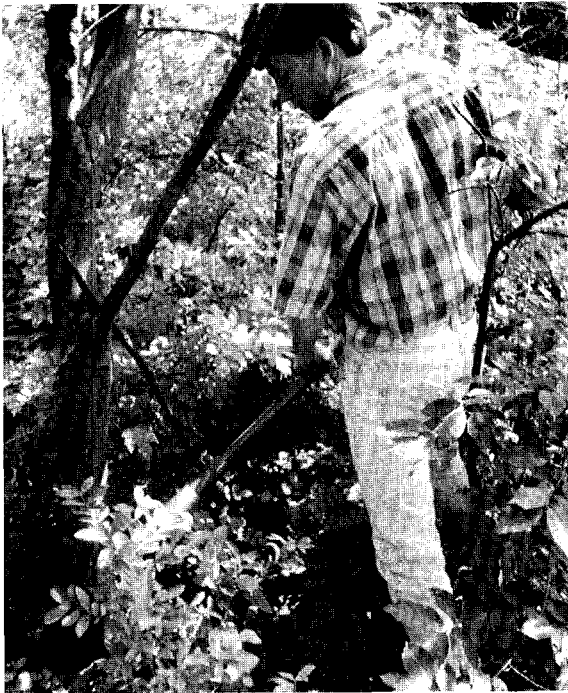
Figure 2. The EZ-Ject™ showing difficulty of application in dense stands (EZ-Ject photo substituted for the Wee-Do™).

(dbh), and treated at one injection per 2.5 cm of dbh. Trees averaged 15.0 cm dbh, limiting the number of replications per treatment combination to a maximum of eight. The experiment was designed as a completely randomized, two-factor factorial with individual trees as replicates.