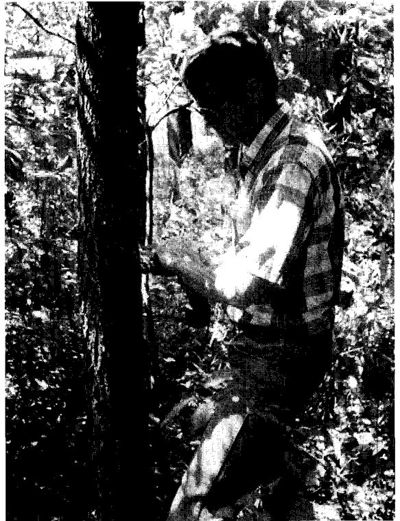
Figure 3. The rechargeable portable drill used to apply Gelcaps™.

Chemical and treatment evaluation. The standard hack-and-squirt technique proved to be the most efficacious treatment for both species (Table 1). This method resulted in 100% mortality when used with picloram and 89% mortality when formulated with triclopyr. Statistically, only the