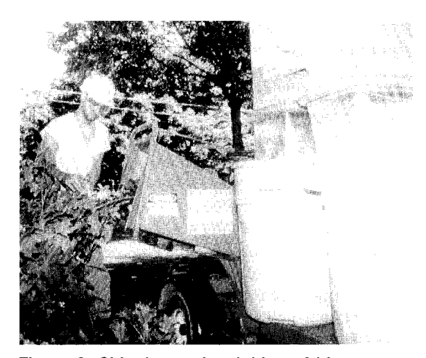
Figure 2. Chipping and weighing of biomass removed in trimming.

Data were analyzed using analysis of variance (ANOVA) and differences between means tested using Tukey's pairwise comparisons. The analyses compared tree response to application methods, dose across application methods and dose with an application method. Certain trees were excluded from the analysis because the data were uncertain (lying well outside the normal distribution of the sample population) or missing altogether. The sycamore data set was eliminated