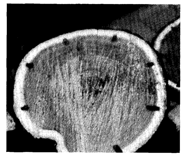
Figure 4. Cross-section of red oak shows the compartmentalization that occurs during wound closure. Photo is two seasons after treatment. Note the lack of tree damage and how well trees recover.