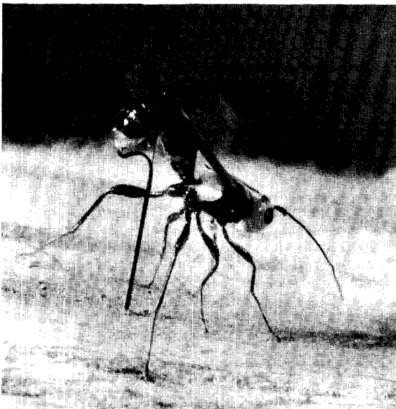
Figure 4. Adult parasites of eucalyptus longhorned borer larvae lay eggs through the tree bark with long ovipositors onto the larvae mining beneath.

plete destruction of beetle-infested wood will reduce the number of adult beetles searching for new hosts. A classical biological control program will also reduce beetle populations. Natural enemies of the borer from Australia have been released in California. An unnamed species in the genus Avetianella parasitizes the eggs of the beetle, laying as many as four eggs inside each beetle egg. This parasite develops in 16 days at 25°C and the adults live 25-30 days. In addition to the egg parasite, other species of parasitic wasps that attack the larval stages of the beetle have been released. Two Doryctes spp. are small gregarious larval parasites while Syngaster lepidus (Figure 4) and Callibracon capitator are large solitary larval parasites. Although the release phase of the biological control program is in its beginning stages, it is hoped that the combination of parasites that utilize different life stages of the beetle, and potentially different sizes of larvae, will effectively reduce the number of adult beetles available to lay eggs on new trees. The natural enemies will not eradicate the pest, and there will always be some susceptible trees in managed or unmanaged urban forests. However, the combination of proper care and biological control should