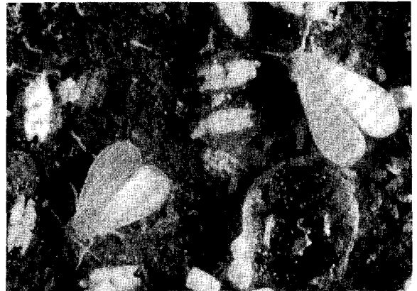
Figure 1. The ash whitefly adult and immature stages on the under side of ash foliage.

Siphoninus phillyreae , the ash whitefly (Figure 1), was first detected in southern California in the summer of 1988 (2). By 1992, the insect was distributed throughout the state and was also reported in Nevada, Arizona and New Mexico (4). Female whiteflies lay eggs on the underside of leaves of host trees. Nymphal whiteflies feed on plant fluids and excrete large quantities of honeydew. Damage to the plant results from both removal of nutrients by the feeding whiteflies and limited photosynthesis because the black sooty mold growing on the honeydew blocks light penetration. Whitefly developmental time is 28 days at 25°C (16) and there are multiple overlapping generations resulting in densities of the immature stages on leaves approaching 31/cm 2 by mid-summer (12). Trees suffer premature defoliation