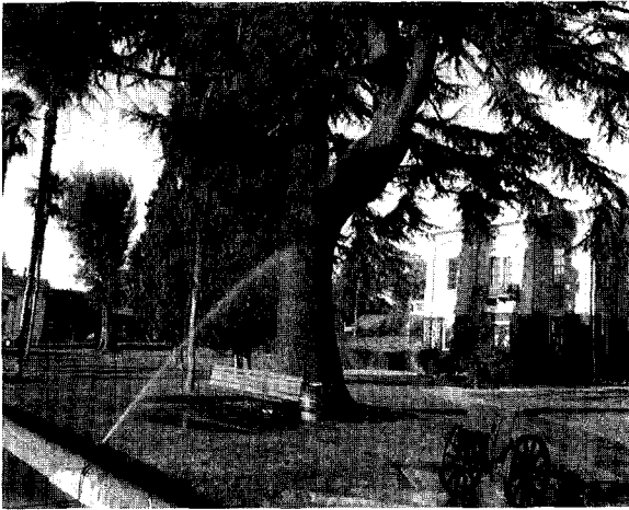
Fig. 2. Improperly irrigated Deodar cedar's trunk and root crown area created conditions conducive to the development of root rot.

cially overwatering. Tact and skill are needed in phrasing questions.