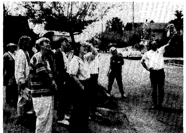
Fig. 3. Citizens reviewing the issue of planting and placing appropriate trees.

The certificate will be redeemable at all nurseries associated with the Washington State Nursery and Landscape Association (WSNLA).