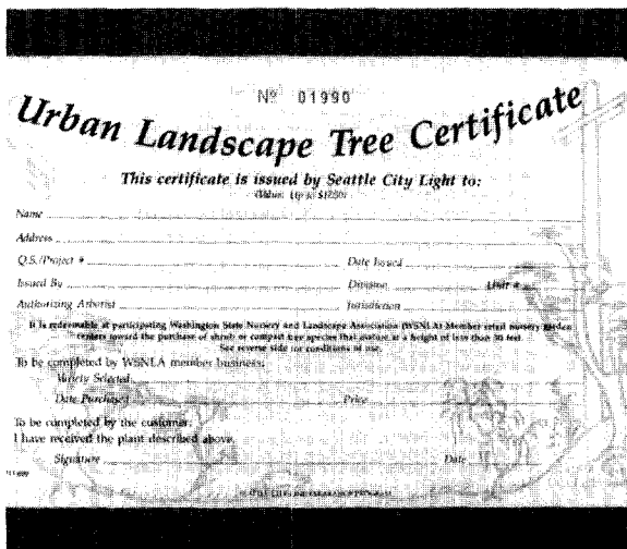
Fig. 4. Urban Tree Landscape Certificate