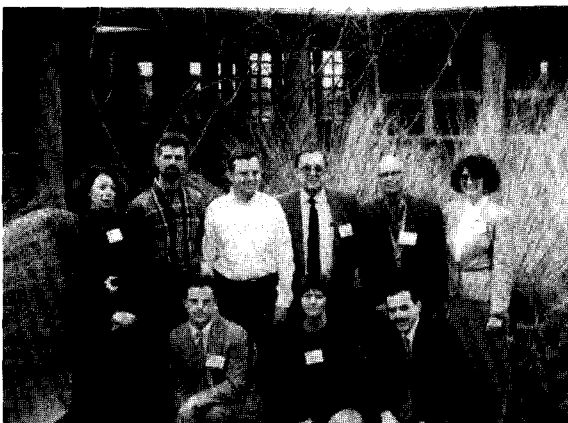
Fig. 2. Seattle City Light's Citizen Advisory Forum.