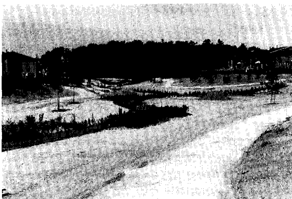
Figure 1. Storm water detention pond with naturalized plantings and trails.

To be effective, these policies must be implemented in a co-ordinated fashion by a wide cross-section of staff professionals: urban