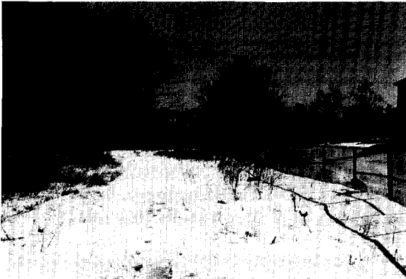
Figure 4. A 7.5 meter setback between the ravine top-of-bank and residential rear lot line.

builder applies for building permits. The municipality must apply strict management techniques at this stage. In Oakville, no building permits are released until the permanent, 1.2 meter high chain link fence is installed by the developer around all parkland. Fencing is an essential management tool to protect the natural woodland park. Formal park entrances ensure equal access to the trail system for all residents.