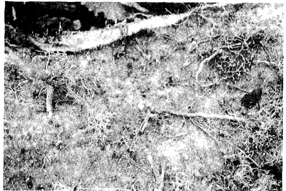
Figure 3. Red maple roots growing in, through and atop a spunbonded fabric.