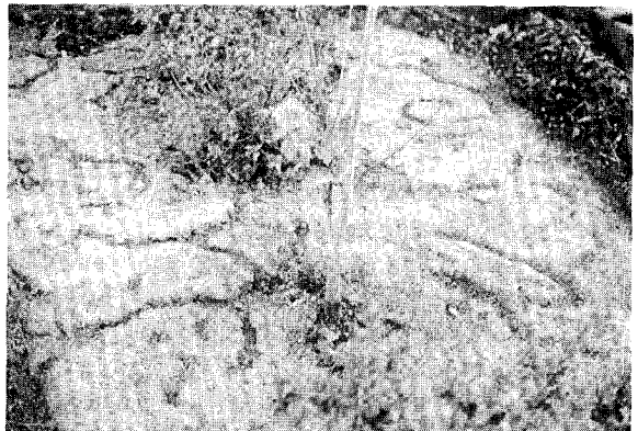
Figure 4. Mole runs increased under the plastic and fabric coverings.