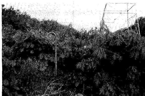
Figure 6. Tree-shrub-herb cover type (oak sprouts-blueberry-goldenrod) of low resistance to tree invasion.