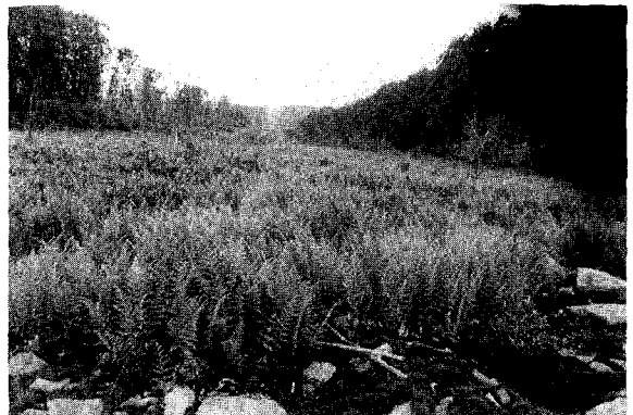
Figure 4. Herb-grass cover type (hayscented fern-blueberry) resistant to tree invasion.