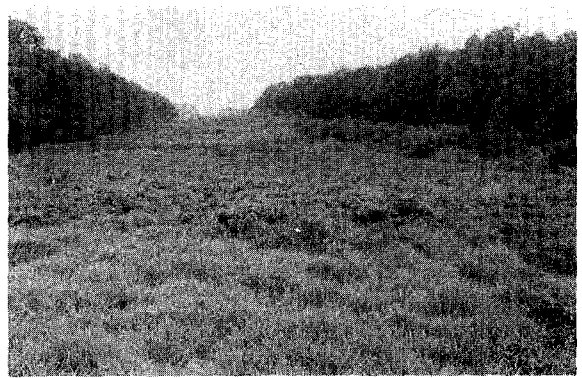
Figure 2. Shrub-grass cover type (blueberry-fescue) highly resistant to tree invasion.