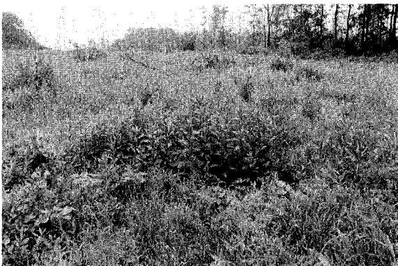
Figure 3. Herb-grass cover type (goldenrod-fescue) highly resistant to tree invasion.