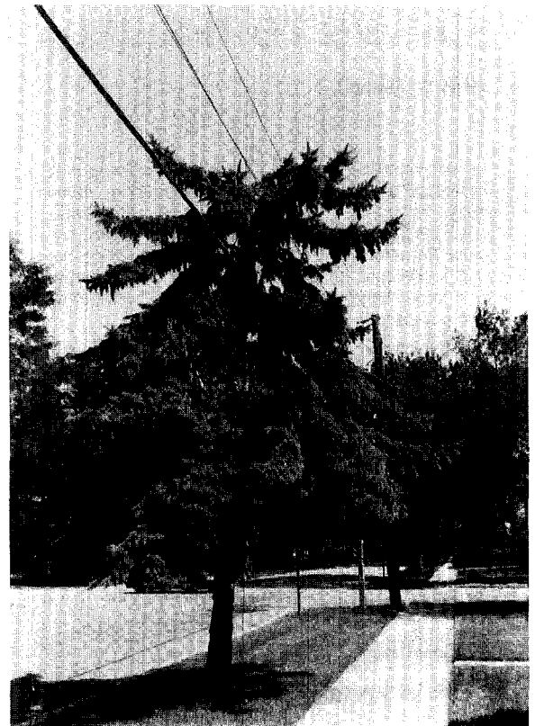
Fig. 2. Planting appropriate parkway trees under power lines.