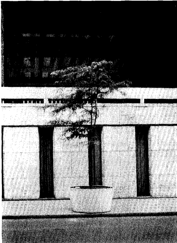
Fig. 1. Trees are often placed in above ground containers when utility or sewer lines make in-ground planting impossible.

There are many small to medium sized trees that tolerate wide fluctuations in soil water status, as may be found in the containers. Such species may eventually outgrow their containers, as transpirational water loss exceeds the container's storage of precipitation. But their slow rates of growth and relatively small mature sizes allow them to thrive in