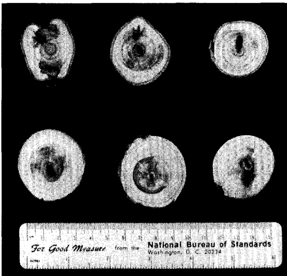
Figure 1. Cross-sections through weak compartmentalizing tree. Upper left section showing wound-induced wood discoloration into center of tree and no Wall 2 formation. Other cross-sections showing various patterns of wood discoloration associated with borer activity. Borer exits shown in upper left and center sections.

There were also marked differences between strong and weak compartmentalizers in what appeared to be microbial discoloration in the springwood regions of annual rings. In weak compartmentalizing trees, discoloration or "flecking" occurred in most annual rings, frequently totally