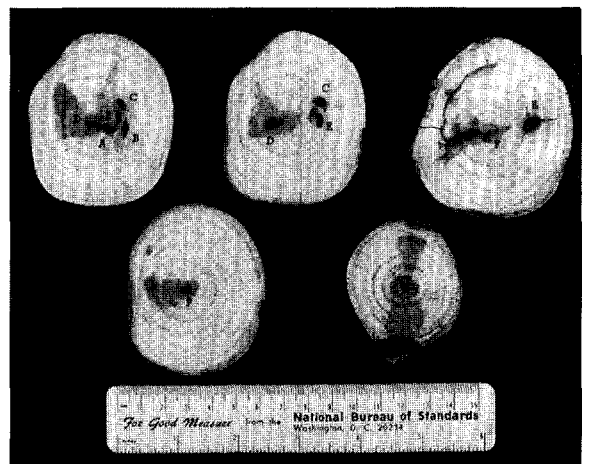
Figure 2. Cross-sections through a weak-compartmentalizing tree (wounded section, lower right). Considerable wood discoloration was associated with borer activity. Note also discolored flecks in most annual rings, probably denoting fungal infection.