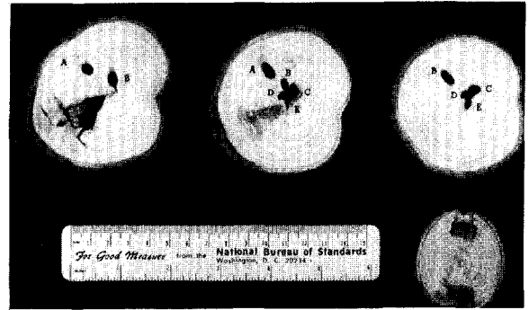
Figure 3. Cross-sections through a strong compartmentalizing tree (lower right, chisel wound made on smaller of 2 trunks). Borer tunnels of A and B were present in the tree when massive attack of 3 borers (C, D, E) occurred at roughly the same entrance site, causing considerable wood discoloration. However, this discoloration was not evident 4 cm above entrance (upper right disk) and no discoloration was associated with the borer tunnels.

The inescapable conclusion was that weak compartmentalizing green ash trees were more likely to suffer from ash borer attack than were strong compartmentalizing trees. All of the "sick" trees in the aforementioned provenances were weak compartmentalizers, as were 2 other trees that did not yet show any external symptom of "in-