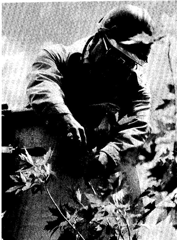
Figure 1. Measuring sprout growth in the fall of 1985.

As in earlier studies where growth regulators were trunk injected into either mature trees on city streets (6) or into tree seedlings grown in the greenhouse (2) it was found useful to order the sprouts that grew on the top 0.5 m of the silver maple trees into various classes by length. Such a frequency distribution for each of the treatments