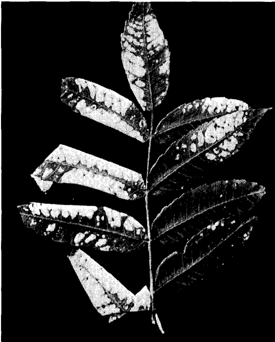
Figure 1. Sulfur dioxide injury on sumac characterized by dead patches of leaf tissue located between the healthy tissue and the veins.

Injury. Air polluting chemicals, alone and in com-