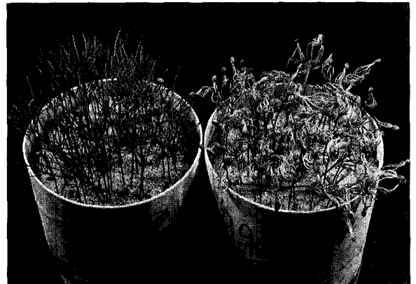
Figure 3. Distortion of young red pine seedlings by tordon (right). Healthy seedlings are on the left.

Many insects can be controlled by systemic chemicals without causing appreciable injury to shade trees. However, this usually requires closer regulation of dosage per tree than does use of conventional insecticides. When systemic chemicals are applied to the soil around tree roots, adsorption of the chemical on soil particles, degradation of the chemical, and capacity of roots for selective adsorption of the chemical reduce the possibility of phytotoxicity from errors in dosage. However, when chemicals are injected directly into trees, the only buffers between the