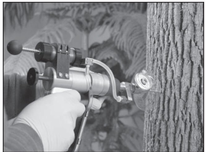
Figure 1. The Arborjet VIPER injection device, equipped with tree gauge to indicate injection pressure in the sapwood, and top mounted 10 mL Dose-Sizer™ to measure amount of formulation applied.

the most environmentally sensitive approach to pesticide application, but wounding and the possibility of subsequent girdling are of concern to the arborist. Arborjet VIPER microinjection was designed to address the concerns of environmental sensitivity and wounding of trees. It limits the number of injection sites set circumferentially around the trunk. The Arborjet VIPER system was selected for use in therapeutic treatments in this study (Figure 1).