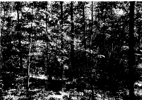
Figure 2. The participant's view at the completely wooded testing site. In such sites traffic and other mechanical sounds have strong detrimental impacts, while natural sounds are enhancing. Similar results obtained for residential and urban park settings, where sounds of children and pets are more tolerated as well.

judge sounds heard there, and so the sounds are not found to be as loud. Conversely, the expectation that wooded areas will be quiet leads people to use more stringent criteria to evaluate sounds heard there, and the same sounds are judged louder.