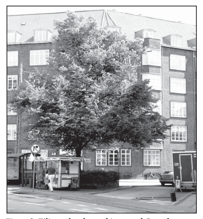
Figure 2. Tilia cordata located in central Copenhagen. Value according to VAT03 is US$7,600.

The tree is located on a residential street with limited traffic. Aesthetically, it is questionable whether the tree contributes in a positive way because it once was one of several trees on a row, but now it is one of very few old and intensively pruned trees, giving the street a poor impression. The Location Factor is estimated to be 1.20.