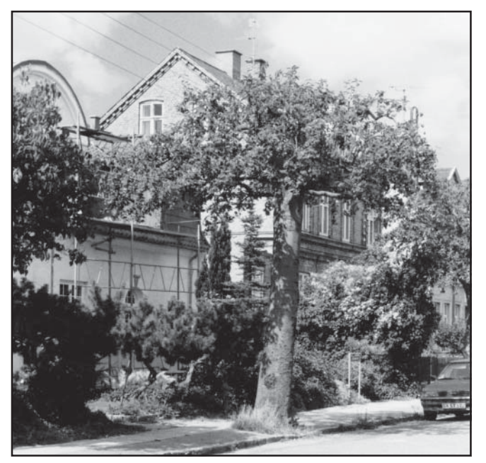
Figure 4. Sorbus intermedia located just outside central Copenhagen. Value according to VAT03 is US$1,100 (photo credit: Lars E.A. Poulsen).

The value of three individual trees would increase 1.9 to 3.6 times using trunk area instead of circumference, and 4.2 to 9.3 times if the largest available tree was used instead of a fixed size of 18 to 20 (7.2 to 8 in.) cm circumference at 100 cm (40 in.) above ground. The prices shown for large trees in Table 4 could be even higher if trees were imported from Germany or The Netherlands.