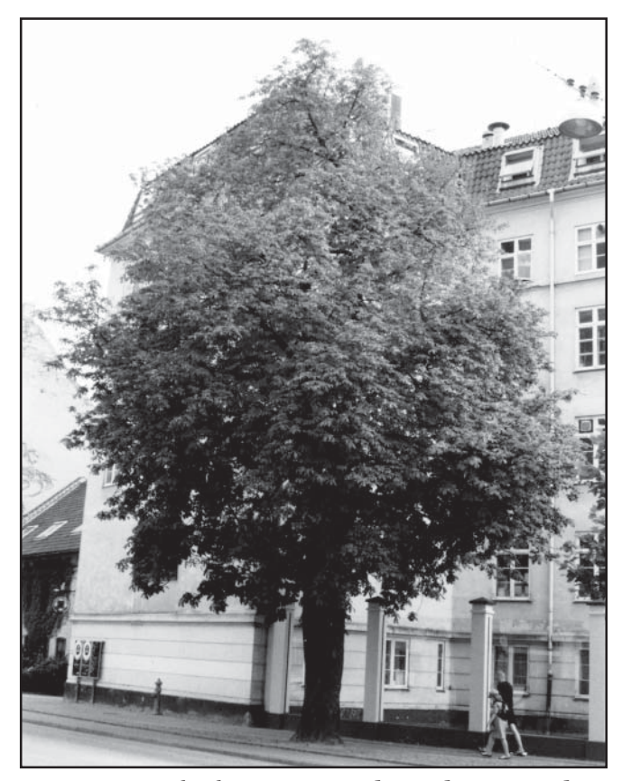
Figure 3. Aesculus hippocastanum located just outside central Copenhagen. Value according to VAT03 is US$8,900.

In Table 4, two central factors used in the CTLA method (2000) are incorporated into the new Danish model in order to show the differences in total value using different factors.