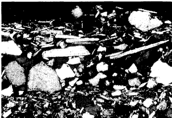
Figure 1. Crusting phenomena in the upper 2 millimeters of a barren soil surface. The picture shows two crusted layers, in which most of the finer soil particles are oriented parallel to the soil surface. Voids appear black. Photographed under circular polarization. (30 x, 1mm = 3cm)

ed leaching; rather than any one factor in isolation. Since a large portion of a healthy root system is concentrated near the road, a root/shoot imbalance may be set up if root kill at that location becomes pronounced.