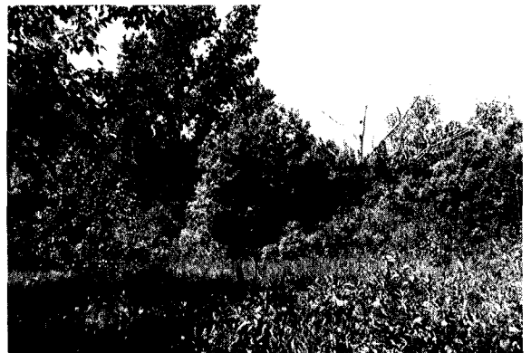
Figure 3. Recreation site preferred by nonurban but not by urban individuals. Nonurban individuals generally thought the naturalness of this forest was an attractive feature, while urban people generally thought this site was too wild and not suitable for recreation.