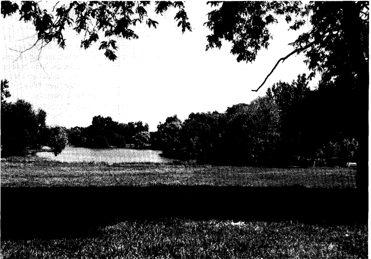
Figure 1. Example of an attractive recreation site. This scene shows natural features such as trees, water, and open space. The area appears well maintained and the vegetation is healthy. Although no specific facilities are visible, the large open area would provide opportunities for a variety of outdoor activities.

Additional information. Photographs can effectively convey information about what features are present in a recreation site. Some important characteristics of sites, however, cannot be captured in photos and the respondents in our study mentioned a number of things they would need to know before they could decide whether the