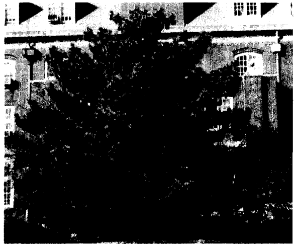
Fig. 1. An affected tree exhibiting advanced stages of the pine blue-stain disease in May 1981. At this stage extensive blue-staining in the wood of the trunk and branches can be observed. The pinewood nematode may also be present in many of the branches having needle browning.

The blue-stain fungus, Ceratocystis ips (Rumbold) C. Moreau, has been consistently isolated from Illinois pine trees exhibiting typical symptoms associated with the pine blue-stain syndrome. The fungus is widely distributed throughout most of Illinois. It has been isolated from infected wood of Austrian ( P. nigra ), red ( P. resinosa ), white ( P. strobus ), Scotch ( P. sylvestris ), Japanese red ( P. densiflora ), and Chinese red ( P. tabulaeformis )