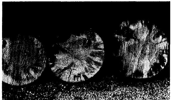
Fig. 2. Wood discoloration in cross-section is wide in the sapwood and extends sometimes to the center of the affected trunk or branch. The individual blue streaks usually extend for several meters in the sapwood of trees exhibiting early symptoms of the blue-stain disease.