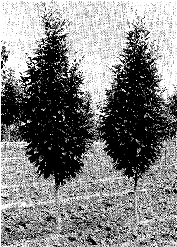
Figure 2. This upright European hornbeam ( Carpinus betulus 'Fastigiata'), commonly grown in Europe, is an example of the many cultivars that need to be more thoroughly tested in urban areas of the United State.

makeup of cultivars (most are vegetatively propagated) generally is very stable, their performance can be predicted with great precision and reliability, provided sufficient background information is available.