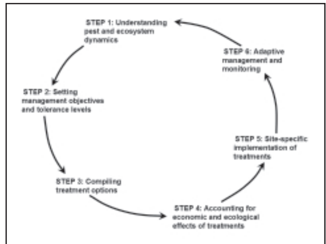
Figure 1. Component steps of Integrated Vegetation Management, a system for managing rights-of-way vegetation (adapted from Nowak and Ballard 2001, and Nowak 2002, from Witter and Stoyenoff 1996).

We have found our IVM system to be useful in organizing research programs on pipeline, roadside, and electric transmission ROWs. Through interacting with various ROW vegetation managers over the past few years, we have