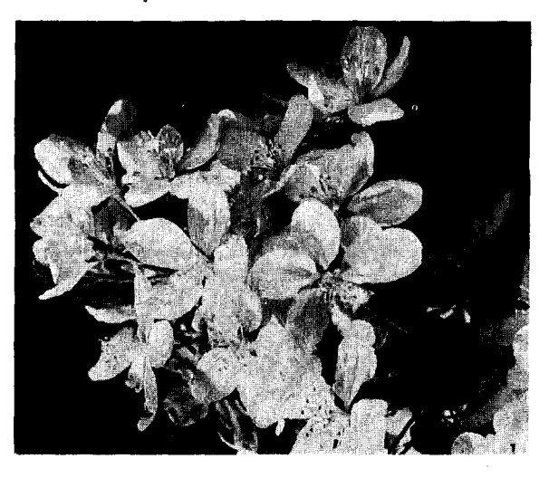
Fig. 3. M. 'White Angel' — This cultivar is one of the best white flowering, red-fruited crabapples for all seasons.

The white, single 1 inch flowers completely cover the tree in late April, producing one of the most outstanding flowering crabapples in bloom (Fig. 3). The large, glossy, dark green leaves are rather attractive. The scarlet red fruit approximately ½ inch across, colors in early autumn, remains highly attractive until after one or more hard freezes, and persists on the tree until mid to late winter. This is one of the last cultivars to have its fruit eaten by the birds.