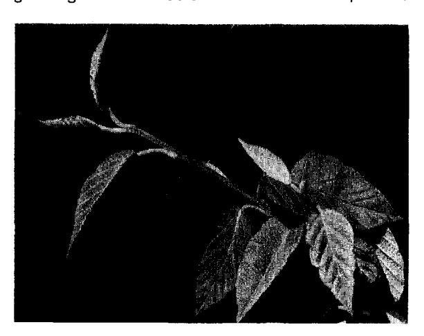
Fig. 2. M. tschonoskii — Young foliage is white, turning to gray and light green. In autumn the foliage color is a very attractive mixture of yellow, orange, red and purple. A good street tree with few flowers and fruits.

The distinct upright, oval form of this species combined with the outstanding leaf color make this species very useful as a focal point or to add growing season color in the landscape. Its