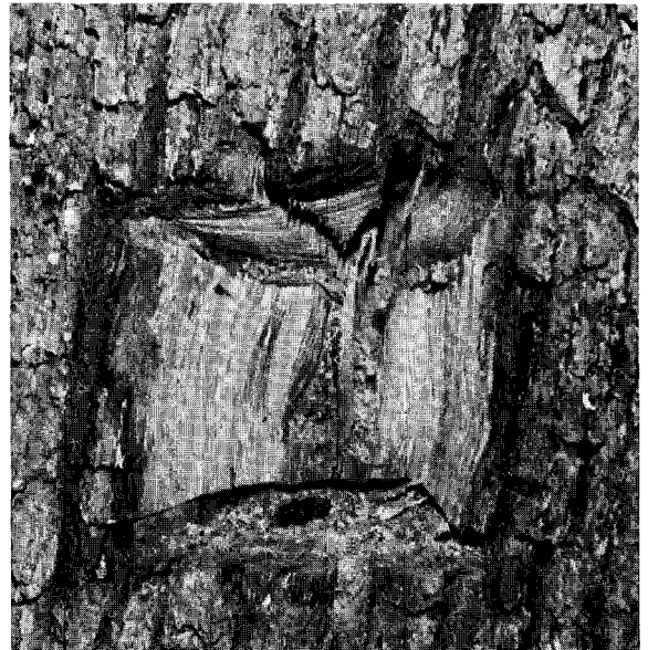
Figure 3. A cavity in a control tree is shown above.

was taken 3 cm (1 in.) directly above each wound to determine if any discoloration had begun (Figure 4). These borings were sterilized in 70% alcohol to kill surface contaminants. They were then cut into one centimeter segments and placed four to a plate in acid strep malt agar. The plates were checked every two weeks for fungal growth. On June 23, 1979, one and one-third years after the wound treatments, two additional increment borings were made directly above the wounds.