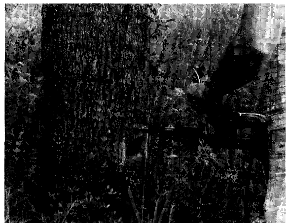
Figure 4. Increment borings were taken above the wounds using a gas-generated increment borer.