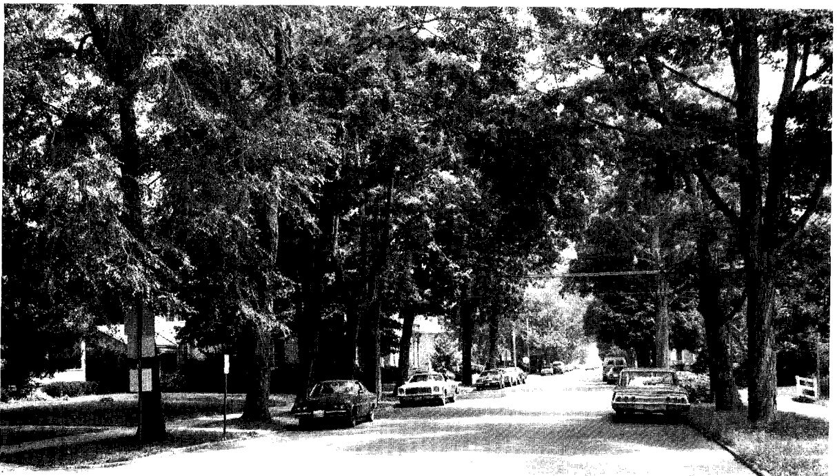
Fig. 1. Street trees in an older residential neighborhood. Trees such as these were the basis of our assessment of municipal tree-care practices.

Fourteen Ohio towns with populations ranging from about 13,000 to 82,000 were sampled. Four random points were located in each of the roughly equal quadrants of each town's map. The points marked the beginning for 16 sample street segments ranging in length from 0.2 to 0.6 mile each. For each sample the land use classification was noted, including the age of residential neighborhoods. We assessed all trees planted in the strip between road and sidewalk, or, lacking