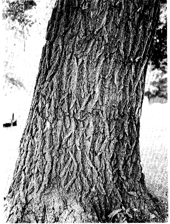
Figure 3. Ulmus pumila bark.