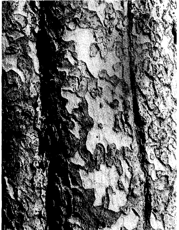
Figure 1. Closeup of Ulmus parvifolia bark