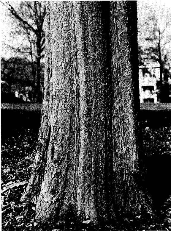
Figure 2. Ulmus parvifolia bark

was introduced into cultivation in the late 1700's. The foliage is deeply green colored, leathery, and matures from 1¼ to 2½ inches long and 1 to 1½ inches wide; the leaves are attached to the pubescent twig in a very distinctive fishbone pattern. The vegetative and flower buds are noticeably smaller than those of Siberian elm and are without the purplish coloration. From Oklahoma south and west to southern California the Chinese elm remains semi-evergreen to evergreen. In colder regions of the country deciduous foliage develops a deep red, purple or even yellow fall color. Eventually Chinese elm may approach forty to fifty feet in height with a broad, rounded crown and spreading branches. Flowering occurs rather inconspicuously in the fall and is immediately succeeded by fruit ripening. Only two other cultivated elms, Ulmus serotina , known as the September or red elm, and U. crassifolia , known as cedar elm, flower in the fall. One significant visual difference between Ulmus parvifolia and U. pumila is the bark: Chinese elm bark becomes flaky with age