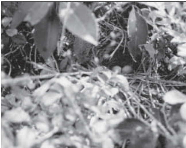
Figure 2. An eastern towhee nest in a low-volume basal spray unit (photo taken by R. Yahner, May 2002).