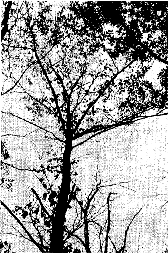
Figure 2. Defoliated tree that has refoliated; sprouting has occurred on the larger branches and main stem.

cutting cycle by 5 to 10 years to make up for the reduction in wood production. Either way it represents economic loss. Growth reduction has been shown to be proportional to the percentage of foliage removed and to the number of consecutive years of defoliation (Kulman 1971).