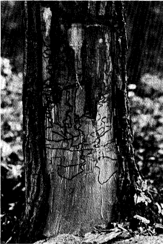
Figure 4. Galleries of Agrilus bilineatus , the two-lined chestnut borer, on the stem of a recently deak oak tree.

In addition, insects such as the two-lined chestnut borer ( A. bilineatus ) can now successfully attack the twigs, branches, and main trunk (Figure 4). Borers tunnel in the newly formed inner bark and wood. These tunnels interfere with the transfer of food down the tree and water and minerals up the tree. The combined actions of the borer in the stem and the fungus in the roots result in rapid death of many defoliated trees.