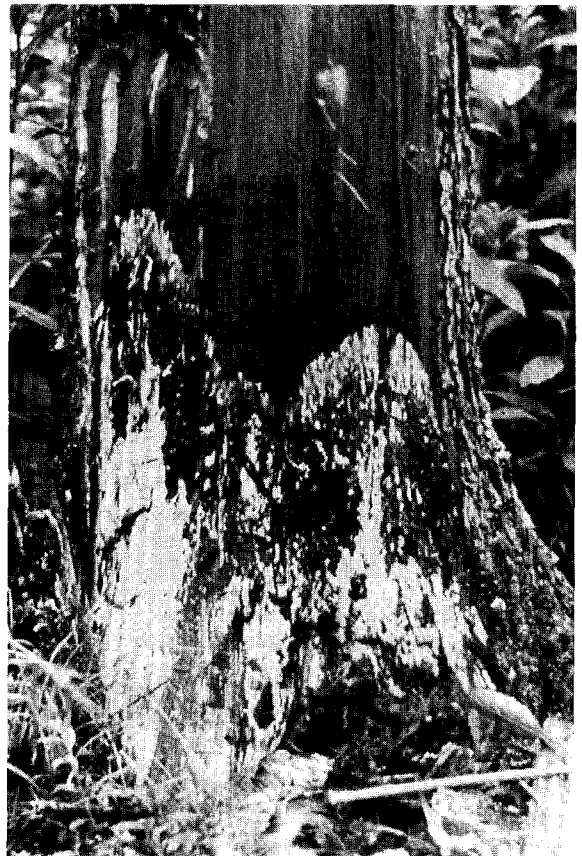
Figure 3. Mycelial fans of Armillariella mellea growing from root collar onto stem in a recently dead oak tree.

Impaired root system. Many small feeder roots needed for mineral and water absorption die after defoliation, probably from lack of food (Staley 1965). This results in poor water and mineral uptake and ultimately in reduced food production in the leaves. The weakening or death of these roots may also create entrance points for fungi such as A. mellea , which, in the presence of continued stress, can successfully grow inside the tree and kill additional root tissue. This further reduces the uptake of water and minerals. Eventually the whole root system and lower stem may be colonized by the fungus (Figure 3).