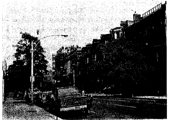
Beacon Street with only 23% of the linden surviving.

Other statistics. The incidence of various kinds of injury was surveyed too, to see what statistical significance each had, and the weight to be attached to each in decision making. Vandalism was the least important in the areas as a whole, although in some corners it was high. (All trees are 2½" caliber to prevent casual breaking, and have wrapped trunks for added protection.) However, vandalism is not worth worrying about compared with other problems relating to survival. (See Chart 2.)