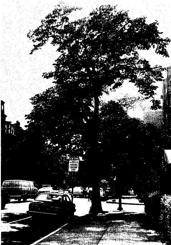
Beacon Street with 65-year old, healthy linden.

What do these individual survival rates tell us? Mainly that the average age of close to 10 years for sidewalk trees is the rule, not the exception. Sidewalk trees do not live long.