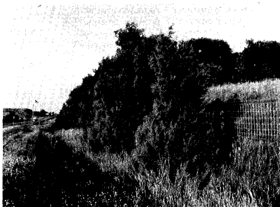
Figure 4. Eastern redcedar approximately thirty feet from the highway edge exhibiting dieback and one-sided habit.

Sodium and Cl accumulate in different amounts in various species (Table 2). The visual injury and degree of salt tolerance correlated closely with the shoot Cl levels. Hedera was more salt tolerant than Viburnum > Pyracantha > Coleus > Cercis . Chloride levels which induce toxicity symptoms in plants are difficult to compare because of the conditions under which the plants were grown and the tissues sampled. Tissue Na and Cl