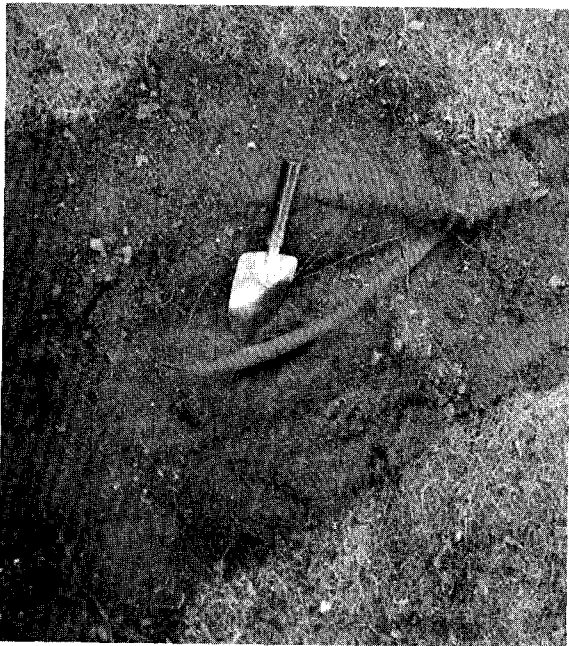
Fig. 2. The soil must be excavated to expose roots with considerable care.

Another factor to be considered is tree location and injectability. It is difficult to excavate a curb-side or road-side tree and this sometimes makes root injection impossible. A tree in a soil with a high water table may also not lend itself to root injection. Then flare injection must be used. This method has not proved as successful as root injection (C.F.S., 1975).