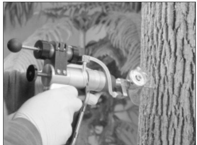
Figure 1. The Arborjet VIPER injection device, equipped with tree gauge to indicate injection pressure in the sapwood, and top-mounted, 10 mL Dose-Sizer™ to measure amount of formulation applied.

trunk. The Arborjet VIPER system was selected for use in therapeutic treatments in this study (Figure 1).