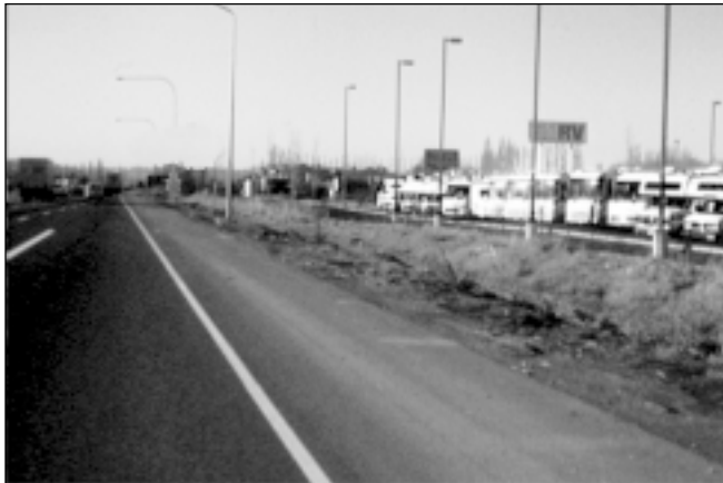
Barren Edge 8 images, loadings .616 to .794 Category mean 1.56, .70 SD