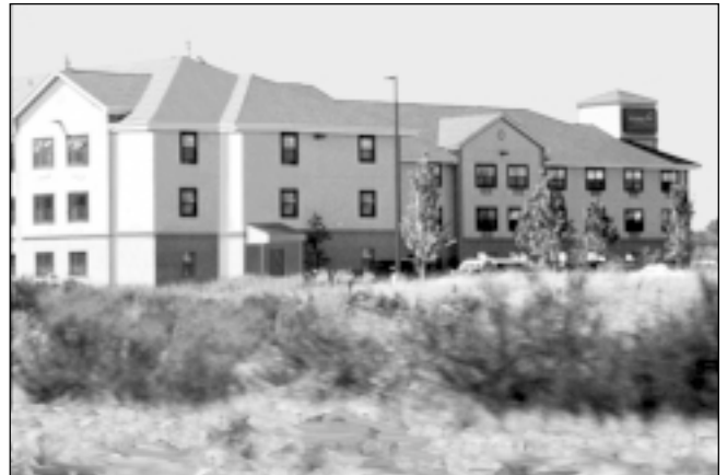
Prominent Buildings 2 images, loadings .590 to .640 Category mean 1.66, 0.77 SD