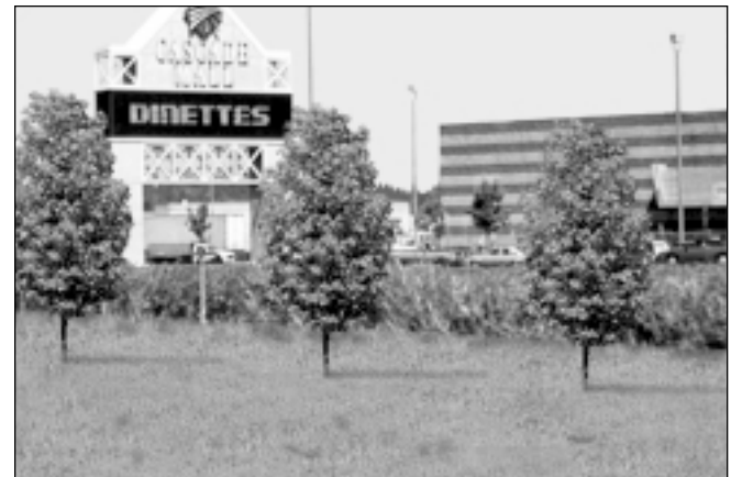
Tree Buffer 2 images, loadings .497 to .674 Category mean 2.88, 0.86 SD