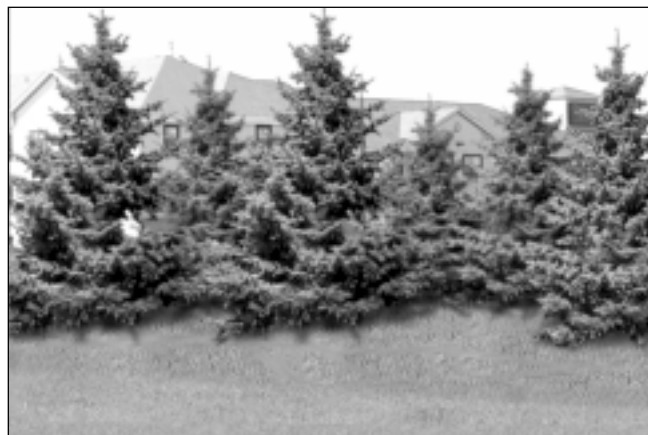
Tree Screen 7 images, leadings .419 to .797 Category mean 3.87, 0.74 SD