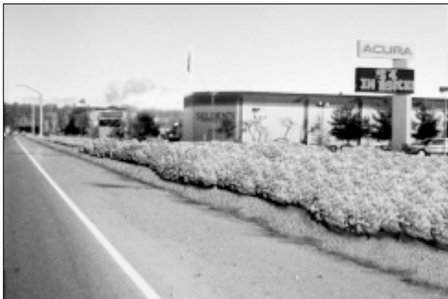
Ornamental Frame 10 images, loadings .590 to .744 Category mean 2.71, 0.79 SD