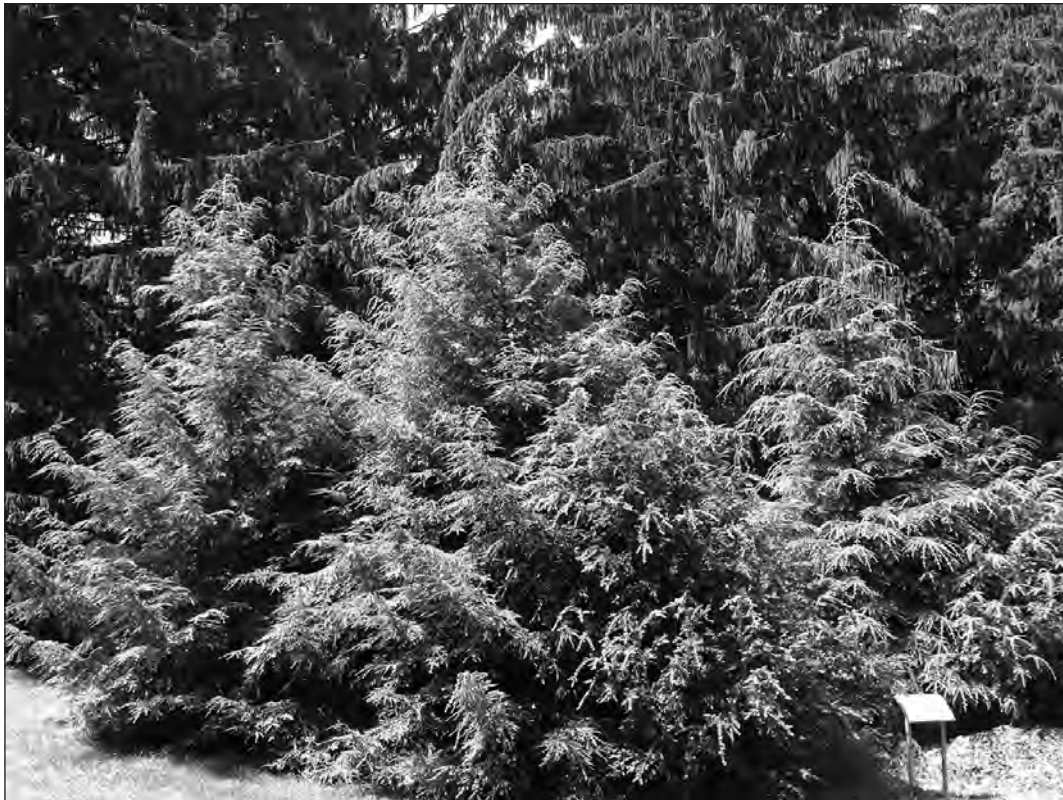
Figure 4. Tsuga spp. Front Gate plot at Lasdon Park & Arboretum, summer 2012.