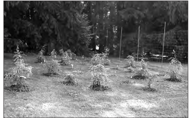
Figure 3. Tsuga spp. Front Gate plot at Lasdon Park & Arboretum, spring 2004.

gests that cultivation under the poly tent will result in greater transplant establishment, which is supported by the higher visual rating for these cuttings ( 3.8 \pm 0.5 ) compared with 3.1 \pm 0.6 for cuttings held under the mist heads. This differential vigor of cuttings under the two cultivation methods is likely explained by the warmer, slightly drier rooting conditions associated with the heating pad and generally drier foliage in the poly tent (J. Kinchla, Amherst Nurseries, pers. comm.). Further evalu-