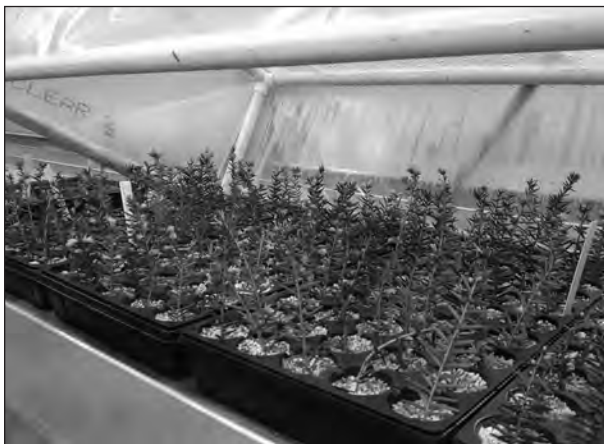
Figure 1. Early-stage Tsuga chinensis cuttings under poly tent in greenhouse.

Hardwood cuttings of the most recent year's growth were taken from T. chinensis growing in the research plots on 20 January 2014, and averaged 12.5–15 cm in length. Cuttings were kept in closed plastic bags, transported to the UMass College of Natural Sciences greenhouse, and potted on 22 January 2014 (Figure 1). The cut ends were dipped in a liquid rooting concentrate (Dip'N Grow, Inc., Clackamas, Oregon, U.S.) at a concentration of 5,000 ppm IBA and 2,500 ppm NAA before potting in sand:perlite (1:1) in standard 50-plug, 25.4 cm × 50.8 cm grow trays. Two growing conditions were compared: 1) under a polyethylene (poly) moisture tent with bottom heat (21°C), and 2) on a mist bench with no bottom heat (air temperature 24°C). Four flats of 50 cuttings each (200 cuttings total) were reared in the poly tent and six flats (300 cuttings total) were reared on the mist bench. Rooting could not be verified until cuttings remained for a “3–4 month” period under the aforementioned conditions (J. Alexander, Arnold Arboretum at Harvard University, pers. comm.). Establishment and vigor were assessed at various times over the following ten months. Vigor was assessed visually on a whole-tray basis using a 0–5 visual rating system, where 0 = 100% mortality of grow tray specimens and 5 = 100% viability and lush, green needles, similar to the vigor rating used to assess tree health in the field.