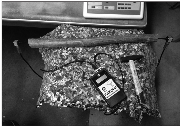
Figure 1. Measuring dynamic modulus of elasticity ( DMOE ) with the Fakopp stress-wave microsecond timer.