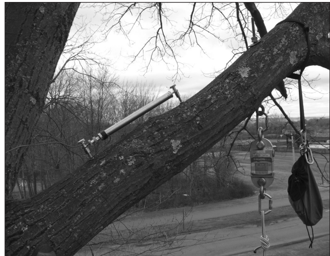
Figure 2. Branch showing, from left to right, strain meter (on top of branch), dynamometer and rope hung from eye bolt, and gear bag indicating location of rope from which drop mass was suspended prior to free falling and loading ascender.

prior to releasing it to load the ascender. The horizontal distance between the eye bolt and the drop mass was 225 mm (Figure 2).