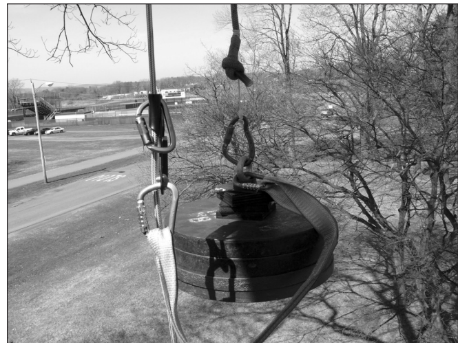
Figure 1. Drop mass (right) and lanyard connected to the ascender (left) and suspended by the short piece of throwline (attached to a larger diameter rope) prior to free fall.

A figure-eight loop was tied in each rope that was tested and connected with an ISC steel D-shaped carabiner (70 kN breaking strength) to a dynamometer (Dillon EDXtreme 11 kN capacity, accurate to 1 N, recording at 60 Hz). A second ISC steel D-shaped carabiner was used to hang the dynamometer from a steel eyebolt 16 mm in diameter that was secured in a branch approximately 12 m above the ground in a red oak ( Quercus rubra ). The branch was 265 mm in diameter at the point where the eye bolt was installed, 304 mm in diameter where it attached to the trunk, and oriented 65 degrees from vertical. The eye bolt was inserted through the branch 1524 mm from the point of attachment. A separate rope was hung on the branch 1798 mm from the attachment to hold the drop mass with a short piece of throwline (4 mm in diameter)