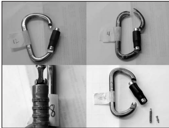
Figure 1. Types of failure of carabiners (clockwise from upper left): key, body, hinge, barrel.

We used the Kolmogorov-Smirnov test to confirm that data were normally distributed, with the exception of surface roughness measurements for Am'D Ball-Lock carabiners. For comparisons involving that variable, we used the nonparametric Wilcoxon's signed rank test to test hypotheses. We used a t-test to compare breaking strength, relative breaking strength, and surface roughness between new and used carabiners of each type, after confirming homogeneity of variance within each comparison by Levene's test. We used one- and two-way analyses of variance (ANOVA) to compare the response variables listed above between failure types and carabiner types (classified by condition), respectively. Where appropriate, we used Tukey's honestly significant difference to test multiple comparisons within each ANOVA. We used regression analysis to investigate the effect of surface roughness on breaking strength.