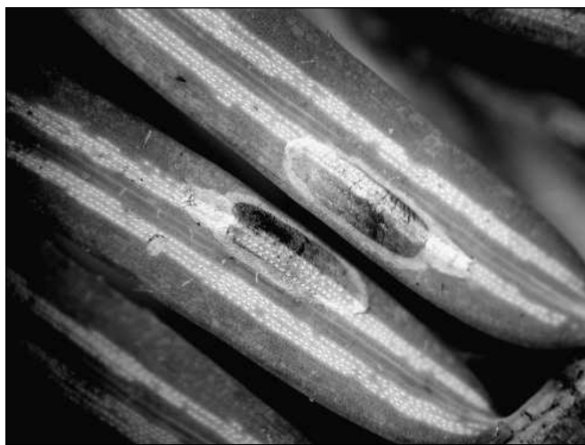
Figure 1. Elongate hemlock scale is one of the most destructive armored scales attacking hemlocks and other conifers in the United States.