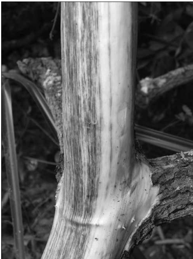
Figure 3. Black discoloration in the outer sapwood of a redbay tree 6 weeks after artificial inoculation with the laurel wilt pathogen, Raffaelea spp.

∇ Among trees inoculated with Raffaelea spp., the proportion of trees from which Raffaelea spp. was reisolated significantly differed between the propiconazole group and the untreated group ( \chi^2 = 13.33 , P = 0.0003 ).