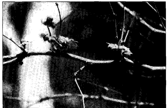
Figure 3. Symptoms of anthracnose on wood up to 3 years old on Platanus spp.: lesion on 2-year-old wood and adventitious shoots growing in whorls.