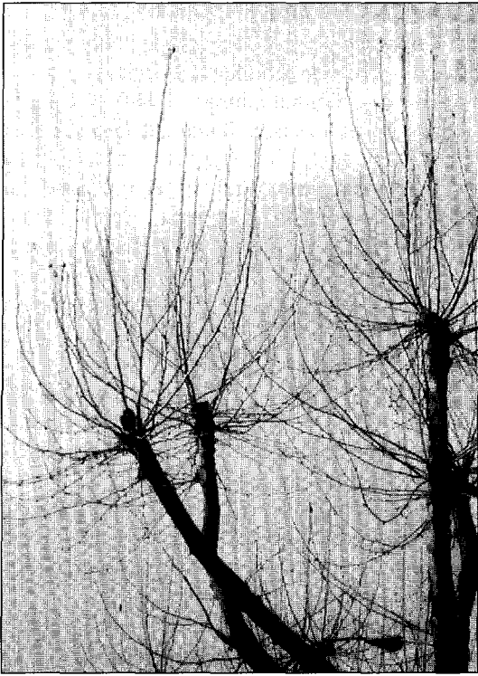
Figure 7. The authors advocate removal of all material that carries the inoculum. The new sprouts are healthy.

very low, giving shade for the promenades. In this technique, all the young branches and shoots are removed. The trees pruned this way are free of the symptoms of anthracnose, apart from a limited attack on leaves that does not pass to the branches.