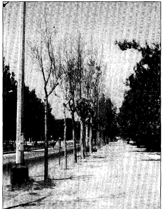
Figure 6. Poorly pruned trees (young infected shoots have not been removed). The leaves are being produced from older wood only.

An empirical demonstration of the benefits of sanitary pruning can be seen in plane trees in Spain. There are two classical types of pruning treatment of Platanus spp.: either no pruning or intense pruning (candelabra-like), in which the skeletal branches of the tree grow