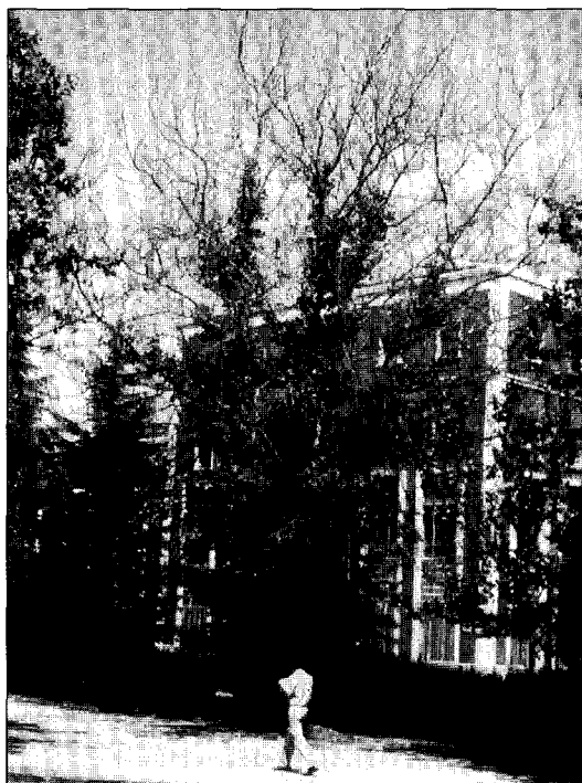
Figure 5. Plane tree in final stage of anthracnose: production of leaves on old wood and trunk; young shoots and branches dead.

toms. If the attack is on an old tree, the symptoms may remain hidden for a longer time.