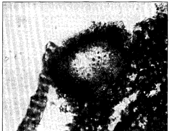
Figure 1. Closed conidiomata of Sporonema platani on leaf of Platanus spp.

We detected some differences in the conidiomata, depending on whether it is formed on the leaves or on the twigs or shoots, and being more open when formed on twigs or shoots (Figure 1 and Figure 2). The conidiophores are hyaline, septate, and branched at the base only. The conidia are hyaline, aseptate, smooth, thin-walled, and straight or slightly curved; the apex is obtuse; the base is more or less truncate, ellipsoid, or clavate, with a size of 9.5 to 12 × 3.5 to 5 µ.