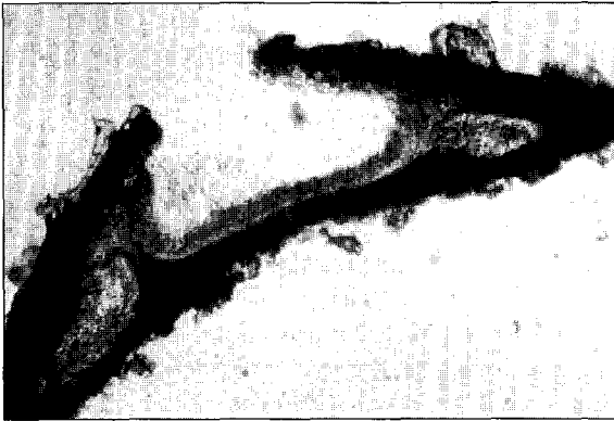
Figure 2. Open conidiomata of Sporonema platani on twig of Platanus spp.

The mycelium is intercellular in the leaves (Viennot-Bourgin 1949), immersed, branched, septate, and hyaline or pale brown (Sutton 1980). The sexual stage is characterized by globose, immerse, short-necked (130 to 400 \mu ) perithecia. Asci (40 to 55 \times 9 to 13 \mu ) carry eight hyaline, two-celled, ovoid ascospores (12 to 16 \times 4 to 6 \mu ) (Viennot-Bourgin 1949).